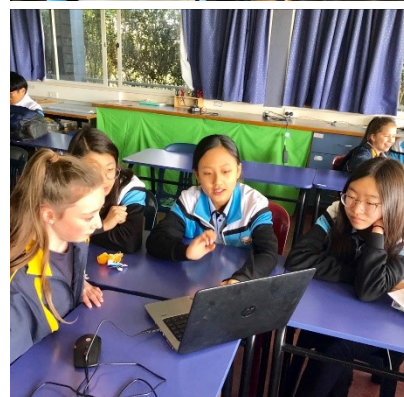
Kwang Sung Dream Students in Year 9 Classes