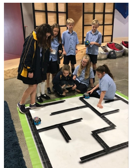
Trip to MOTAT and MindLab

“How does your life show what you believe?”