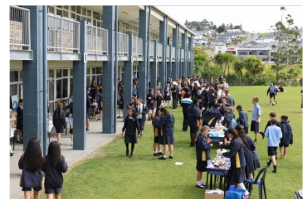
Year 8 Market Day

"What is our Christian responsibility for making a difference in this world?"