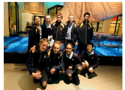
Year 9 Museum Trip

“How do we as Christians reflect and shape a culture today? “