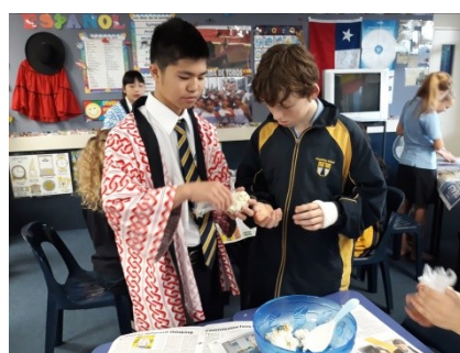
Japanese Food Experience

“Which leaders do we follow and what impact does their leadership have?”