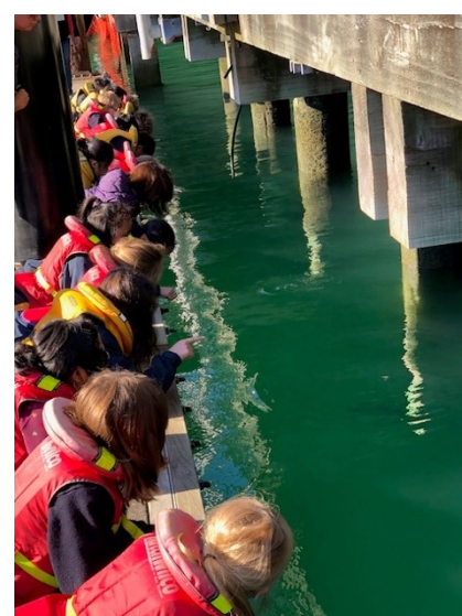
Year 7 Trip to the Maritime Museum