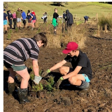
Middle School Service Day at Wenderholm