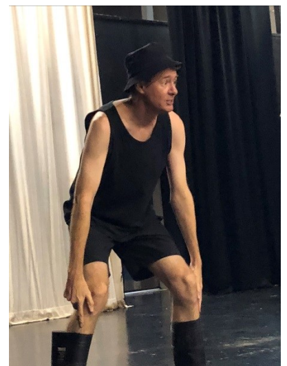
Year 9 Multicultural Day