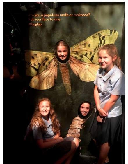
Year 8 Trip to the Auckland Zoo

“What biblical character traits are important for us to live the life that God wants us to live?”