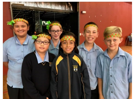
Year 7 Trip to the Corban Estate Art Centre

"How can we be good stewards of the resources that God has provided us in New Zealand?"