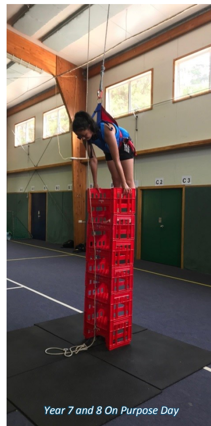
Year 7 and 8 On Purpose Day

"How can we show God's love by responding to the needs of others in a practical way?"