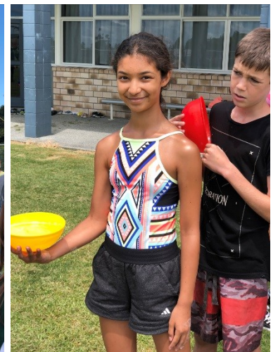
Year 9 and 13 On Purpose Day

“What determines human worth and value? “